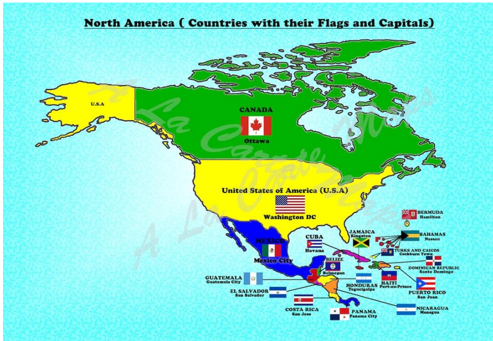
North America ( Countries with their Flags and Capitals)